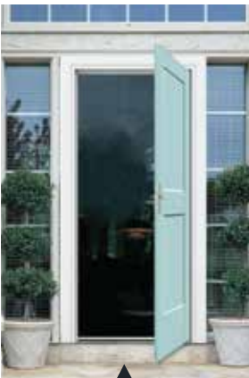
Left-Hand Outswing hinges on left side swings out from home