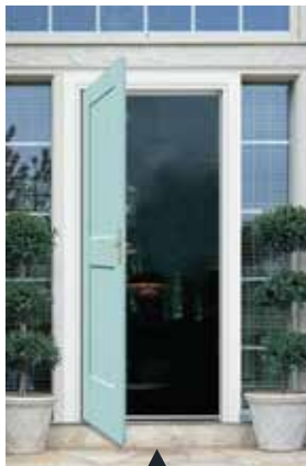
Right-Hand Outswing hinges on right side swings out from home