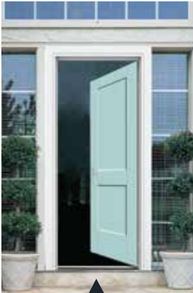
Right-Hand Inswing hinges on right side swings into the home