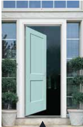
Left-Hand Inswing hinges on left side swings into the home